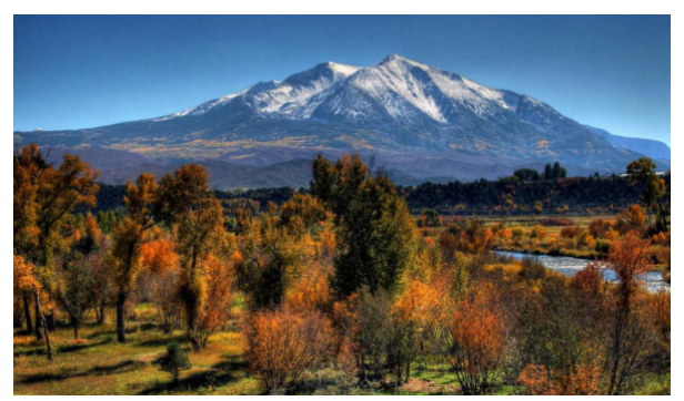
October 10 to 13, 2023 (3 nights) Avalanche Ranch

The Ranch has gotten increasingly popular; hence we check in on a Tuesday and leave on a Friday. That is why we have gone to a weekday trip this year and next. Yes, we have reservations for next year, too. Then we will be checking in on Sunday, October 6, and leaving on Wednesday October 9, 2024. For those of you, who have experienced the Ranch, you know we can be awed by some wonderful fall colors. Views of snow-covered Mt. Sopris from the hot soaking pools are very hard to beat! Enjoy great hiking, and the onsite hot spring pools are open 24/7 for our enjoyment! For those who have not experienced the Ranch, I invite you to treat yourself to a wonderful, fun trip.