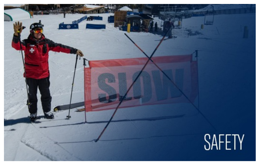
Skier and Snowboarder Safety Reminder

This is for everybody in gatherings that participate in potlucks, group meals, and buffets. With Covid and variants and other respiratory illnesses still making rounds, let's all be diligent about handwashing. Event coordinators, please provide hand sanitizer in areas where food is being prepared and served. If you sneeze or blow your nose or cough on your hands, please wash your hands again before handling food. If anyone sees someone failing to wash their hands in these circumstances, please let them know diplomatically that they are expected to do so.